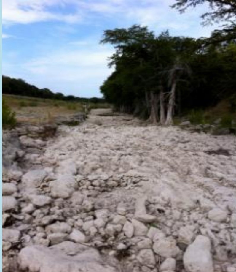
Guadalupe River above Canyon Lake, July 2011

Some drought impacts are pretty obvious.